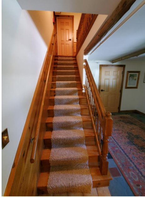
Lake House stairs to second floor