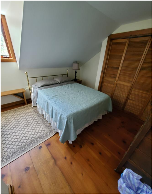
Lake House #6 - second floor, Northwest