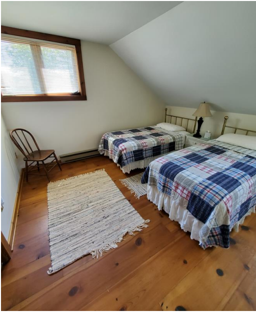
Lake House #5 - second floor, South