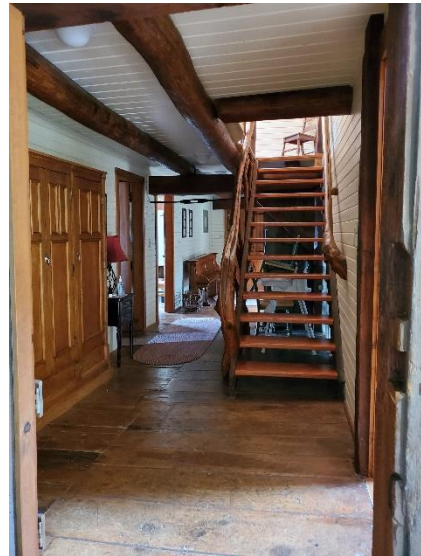
Barn #3 – South Section, first floor master bedroom with bathroom