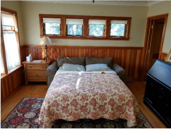
Farmhouse #1 – Main Floor bedroom (off Living Room) with bathroom